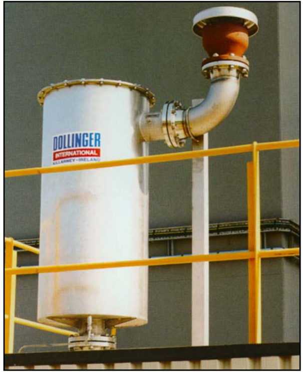
Result of four years of design, development and testing in cooperation with Rolls-Royce®

It provides cost savings which will, typically, pay for its installation in well under a year.